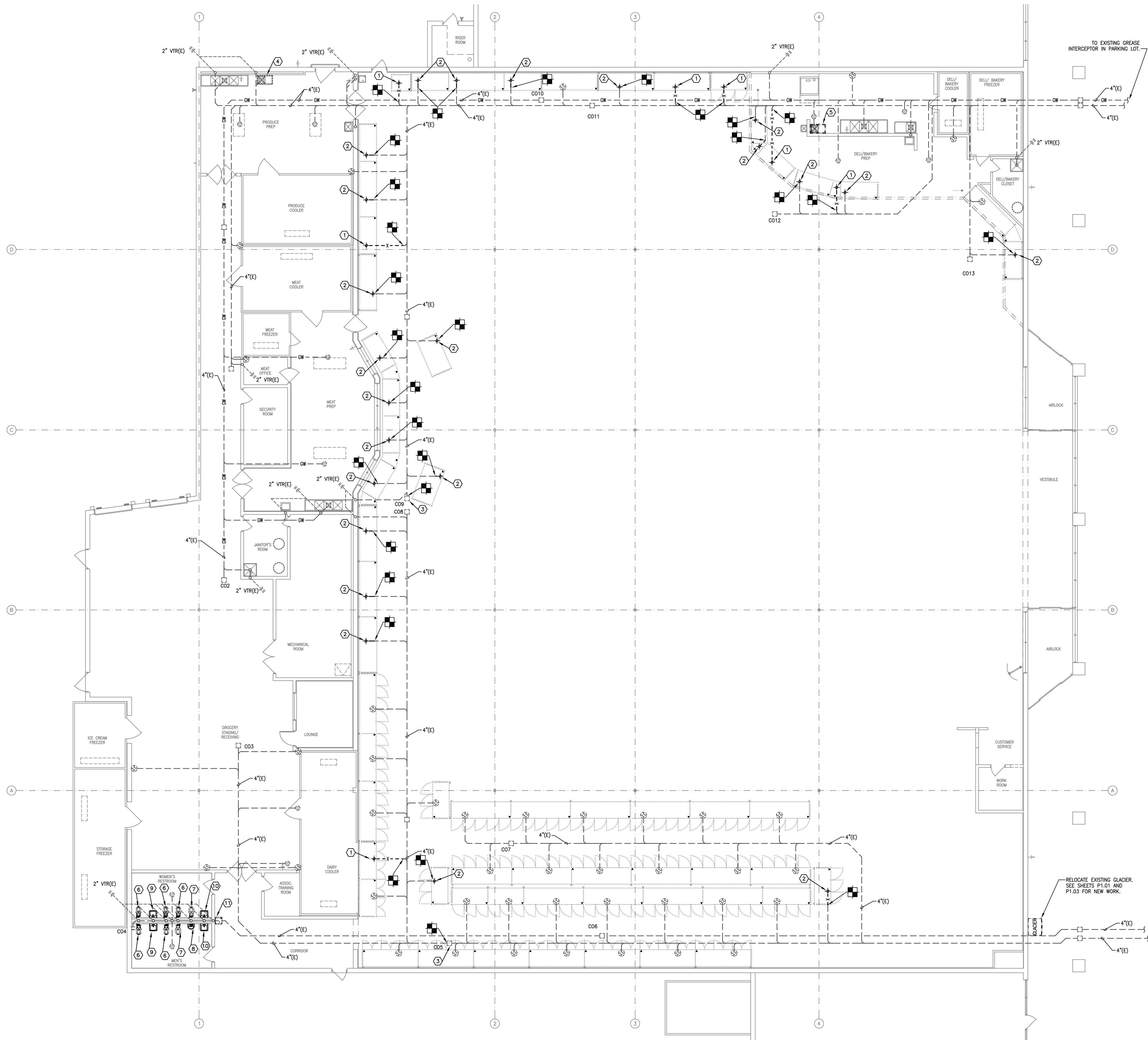
1 PLUMBING DEMOLITION PLAN P0.01 SCALE: 3/32" = 1'-0"